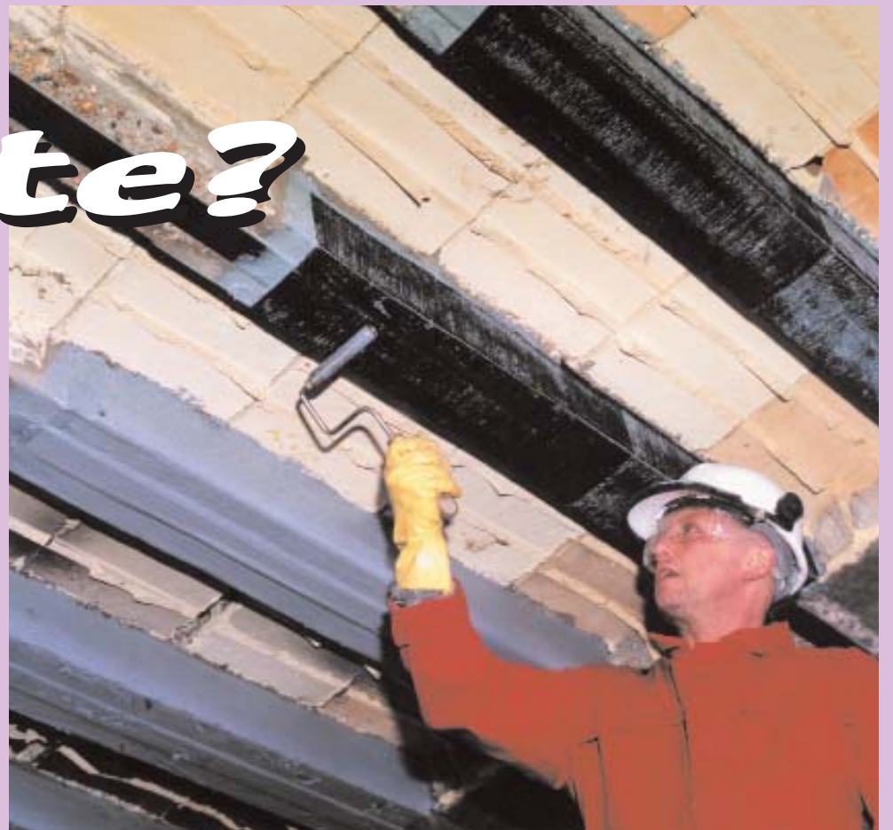
Damaged floor beams being repaired with carbon fibre plating and sheeting.

These factors in combination lead to a significantly simpler and quicker strengthening process than when using other methods. This is particularly important for bridges because of the high costs of lane closures and possession times on major highways and railway lines. For example, using FRP to strengthen a bridge in Canada showed approximately a 30% saving in costs, due chiefly to the fact that the traffic closures that would have been required for other strengthening techniques were avoided.